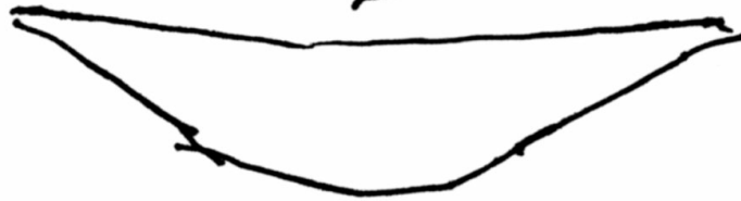
Inner Layer of Mouth Cut 1