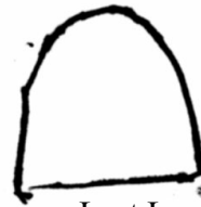
Last Layer Or Pupil Of Eye Cut 2