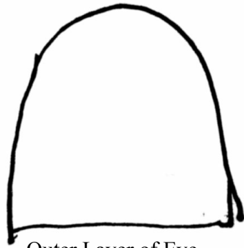
Outer Layer of Eye Cut 2